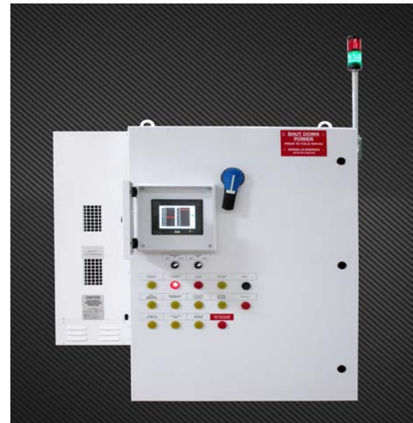
Customized UL Panel Assembly